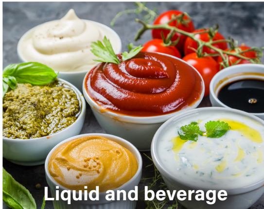
Liquid and beverage