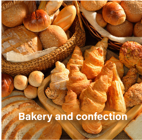
Bakery and confection