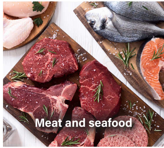
Meat and seafood

AGI offers a full menu of food and beverage manufacturing solutions, each of which can be tailored to meet your specific needs, and your budget. From standalone offerings to providing full turnkey solutions, our team has the experience and expertise to provide integrated solutions.