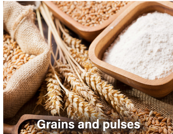
Grains and pulses