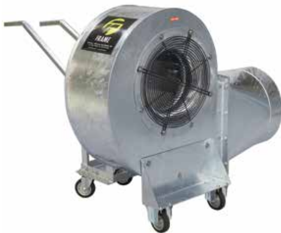
— Mobile fan - front