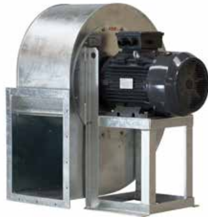
— Fixed fan - back