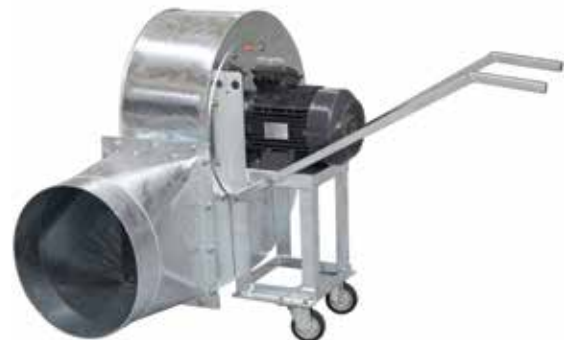
— Mobile fan - back