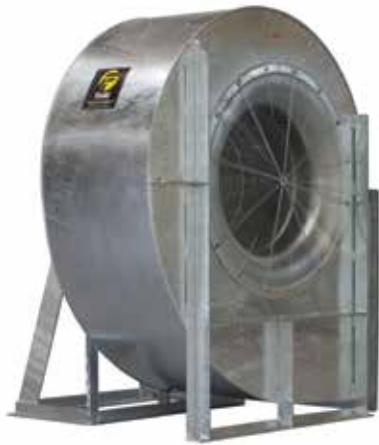
— Fixed fan - front

In addition, the fans are supplied with a mounted starter & 10m of electric cable with plug. Detailed fan curves & noise levels are available upon request.